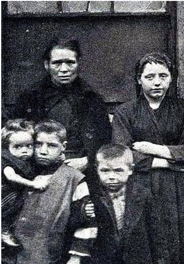
Dublin tenement residents, 1901

https://www.ucc.ie/en/history/undergraduate/thirdyearhistory/