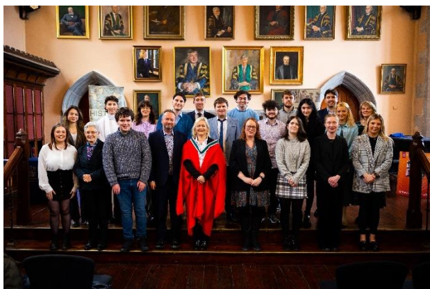
Group picture of prize recipients at the School of History prize-giving ceremony 2024, Aula Maxima, UCC. The prizes were awarded on the basis of performance in the previous academic year, 2022-23.

These are prizes for the best overall performance by a History student in each of the three years. Similar awards are offered for European Studies and History of Art students, though the prize recipients have yet to be decided.