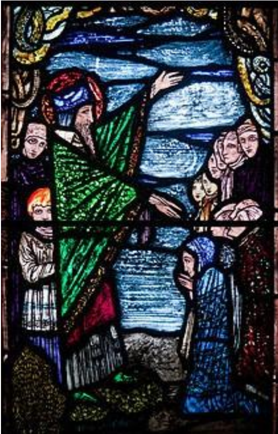
Harry Clarke depiction of St Patrick, St. Michael's Church, Ballinasloe, 1925

https://www.ucc.ie/en/history/undergraduate/secondyearhistory/