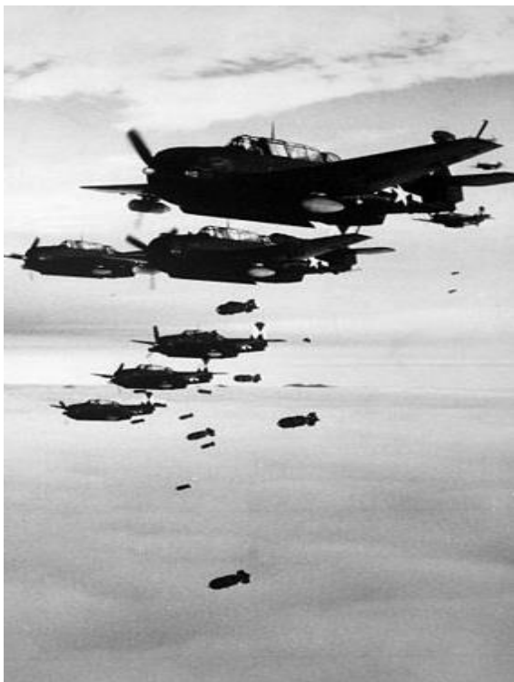
US Navy aircraft dropping bombs on Hokodate, Japan, in July 1945

1 st Year Timetable + Useful Information: https://www.ucc.ie/en/history/undergraduate/firstyearhistory/